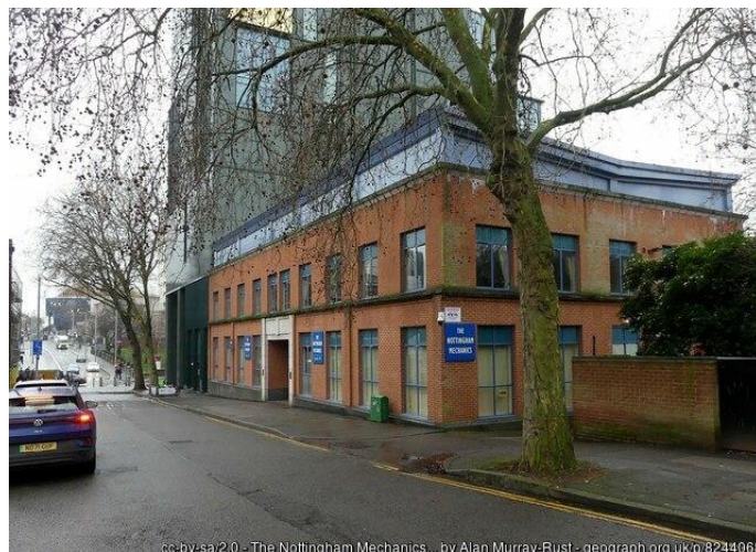
Geograph Summer gathering and AGM 2026.

We look forward to welcoming as many members as possible to our Annual Meeting and AGM in Nottingham on 2-4 June.