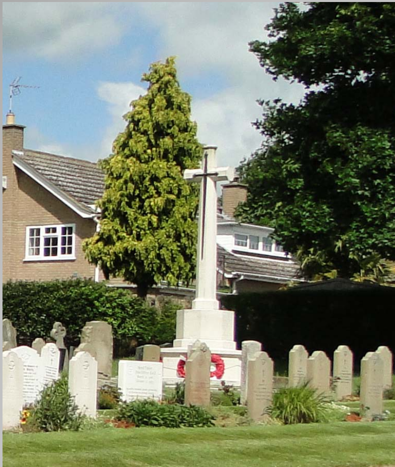
Cross of Sacrifice, Cranwell