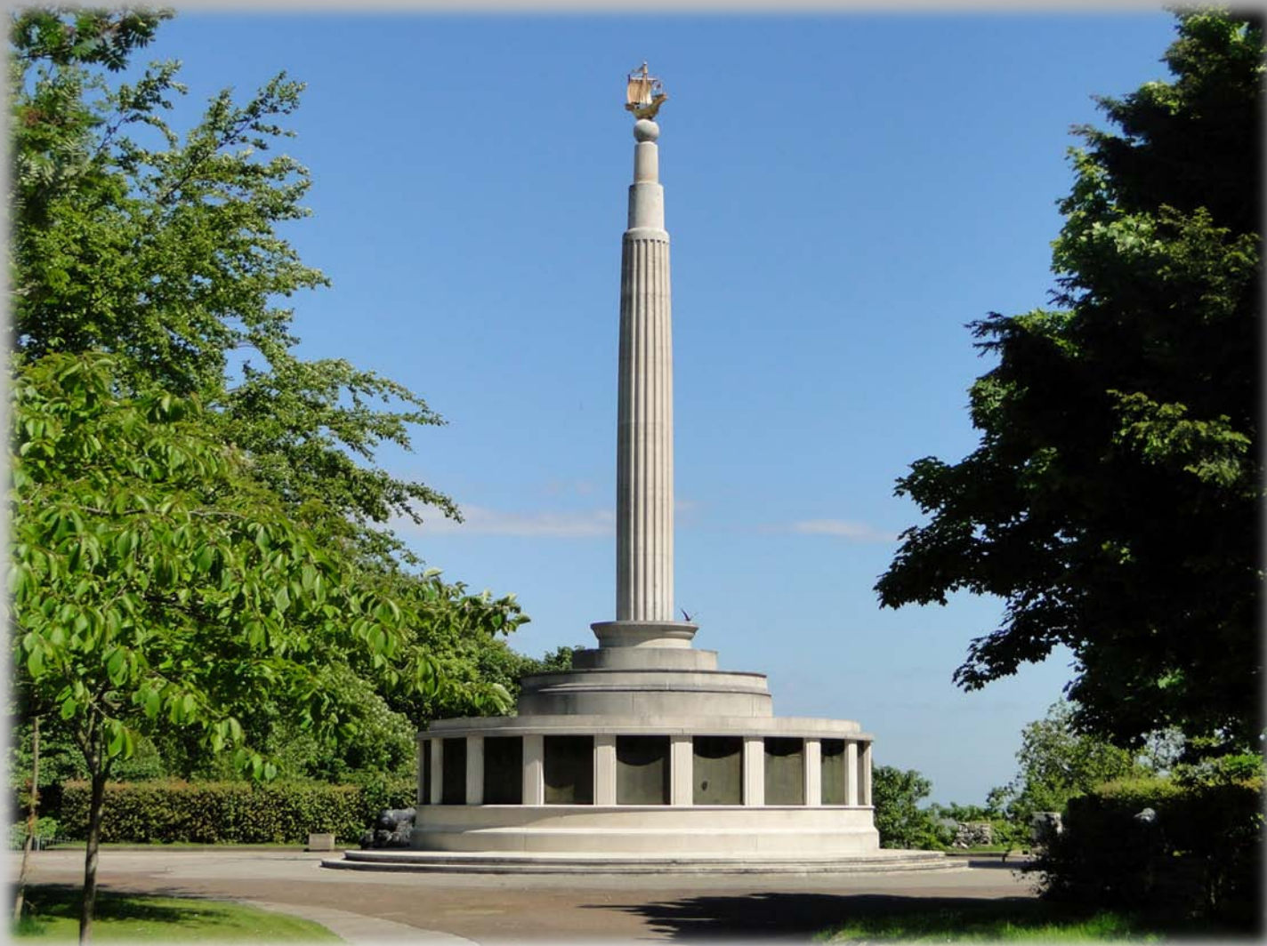
Royal Naval Patrol Service memorial