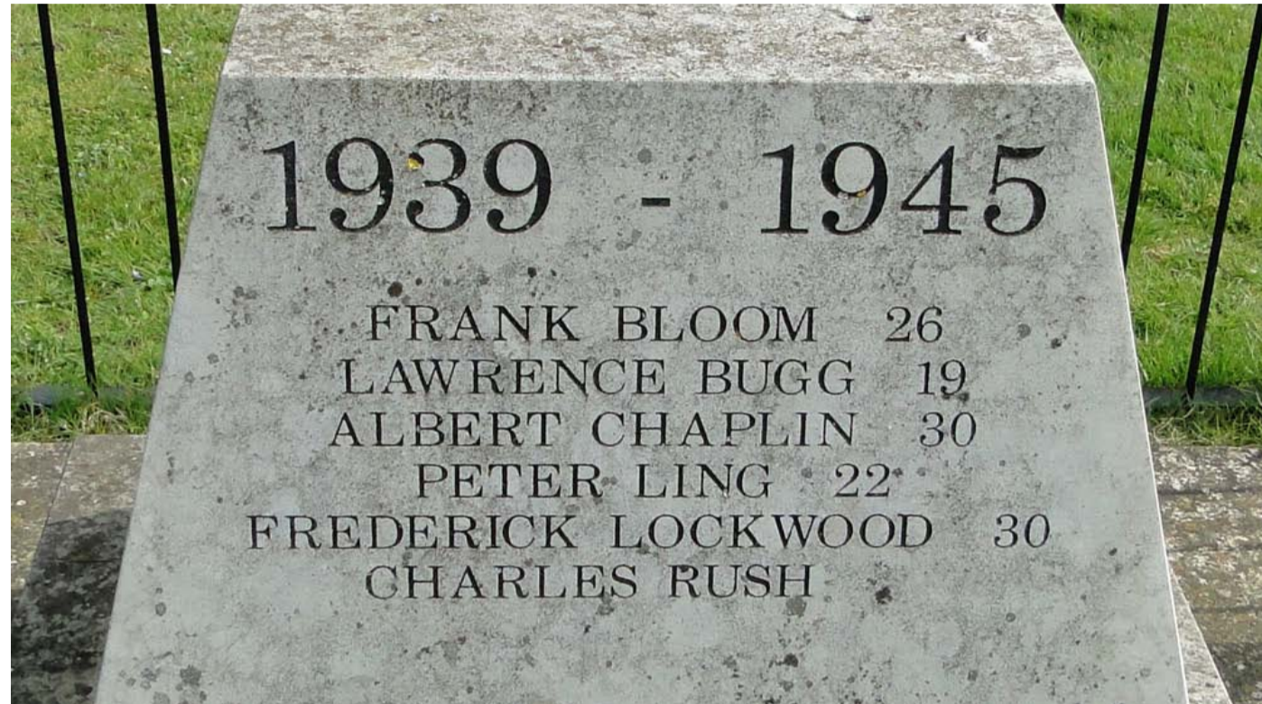
The Memorial Names