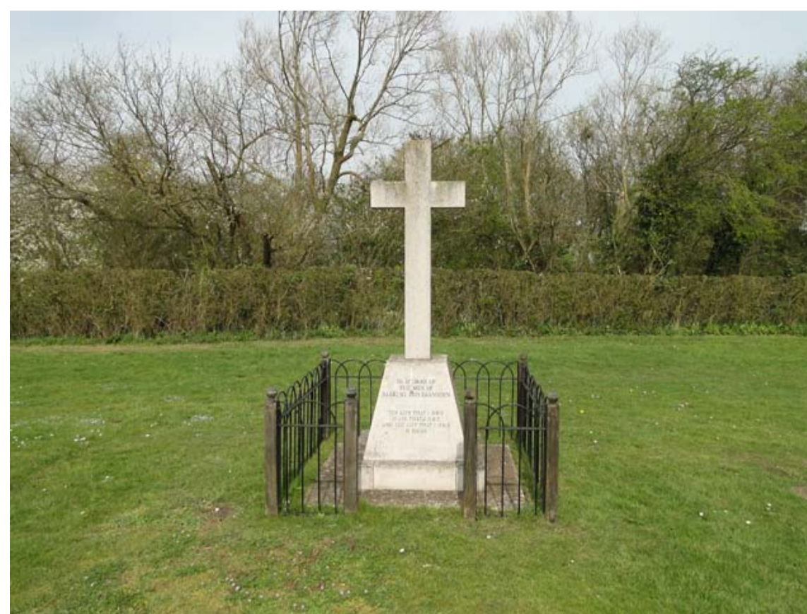
Read the names