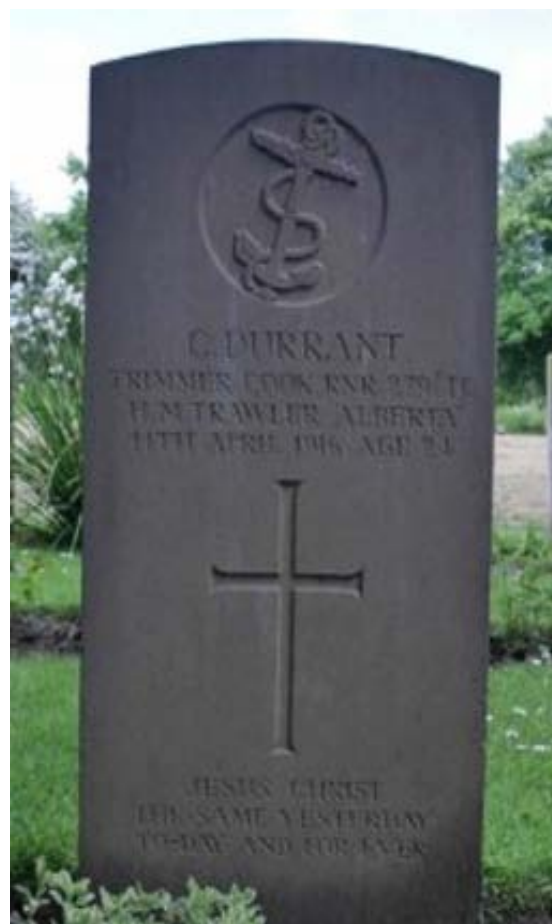
Charles DURRANT