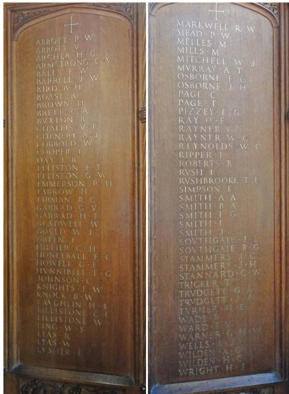
The Memorials in St Peter and St Mary's church