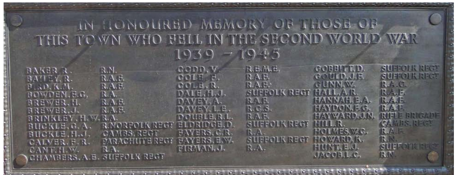
The plaques on the memorial gates