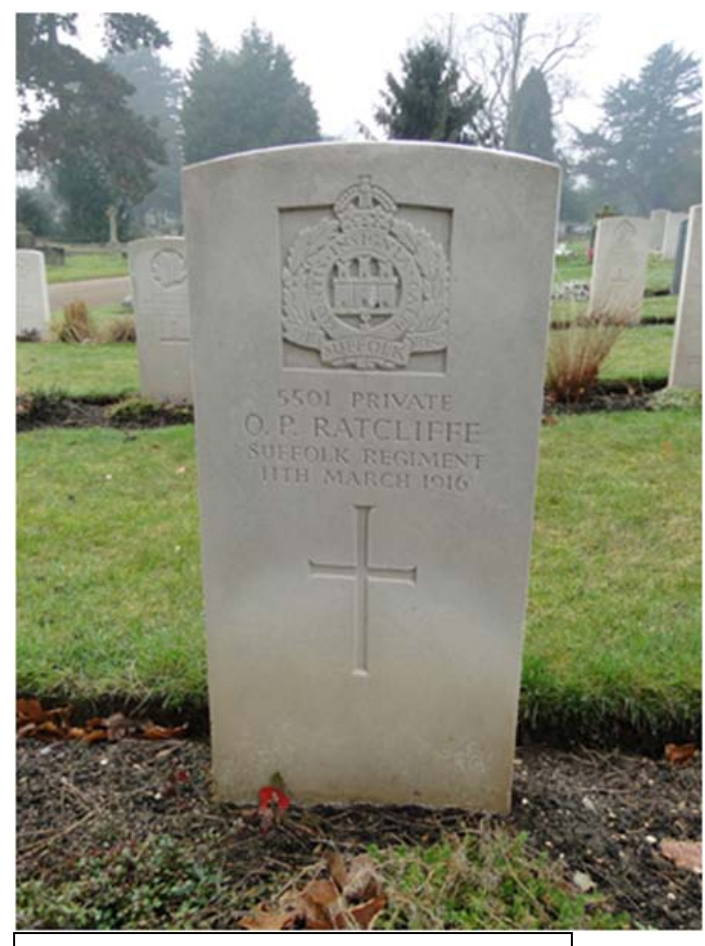
Oliver Percy RATCLIFFE at Colchester