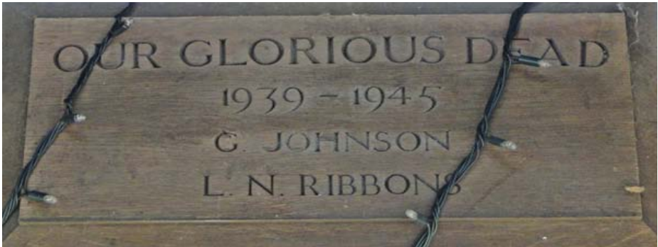
Plaques in the Lych Gate

Disclaimer. While every effort has been made to ensure the accuracy of this record, no guarantee of 100% accuracy is given or implied