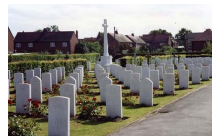
War graves in Fulford cemetery

Disclaimer. While every effort has been made to ensure the accuracy of this record, no guarantee of 100% accuracy is given or implied.