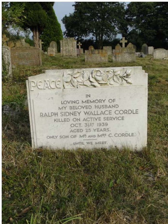
Ralph Sidney Wallace CORDLE